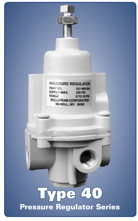
Type 40 Pressure Regulator Series